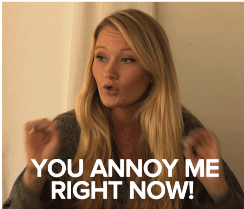
Annoyed White Female

Yet none of the irritated white women acknowledged anywhere in their exhaustion the rage and frustration that people of color and LGBT folk might be feeling because we've kinda wanted all those things—the life, the love, the vote—for hundreds of years and have been routinely denied them. Because of, like, the stereotypes. And the systemic, institutional oppression. And the culture of white supremacy and entitlement. And the microaggressions of the overwhelmingly privileged who had the nerve to express irritation this election cycle when many Americans have been terrified for their safety.